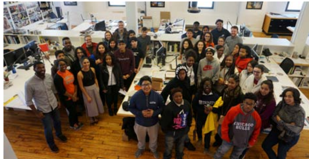
Above: At a career exploration enrichment outing, Horizons for Youth high school students collaborated with Chicago architecture firm Antunovich Associates to develop a robust program proposal for the Barack Obama Presidential Center.

Growing our endowment through new gifts and annual returns will further strengthen our financial position and long-term viability as an organization.