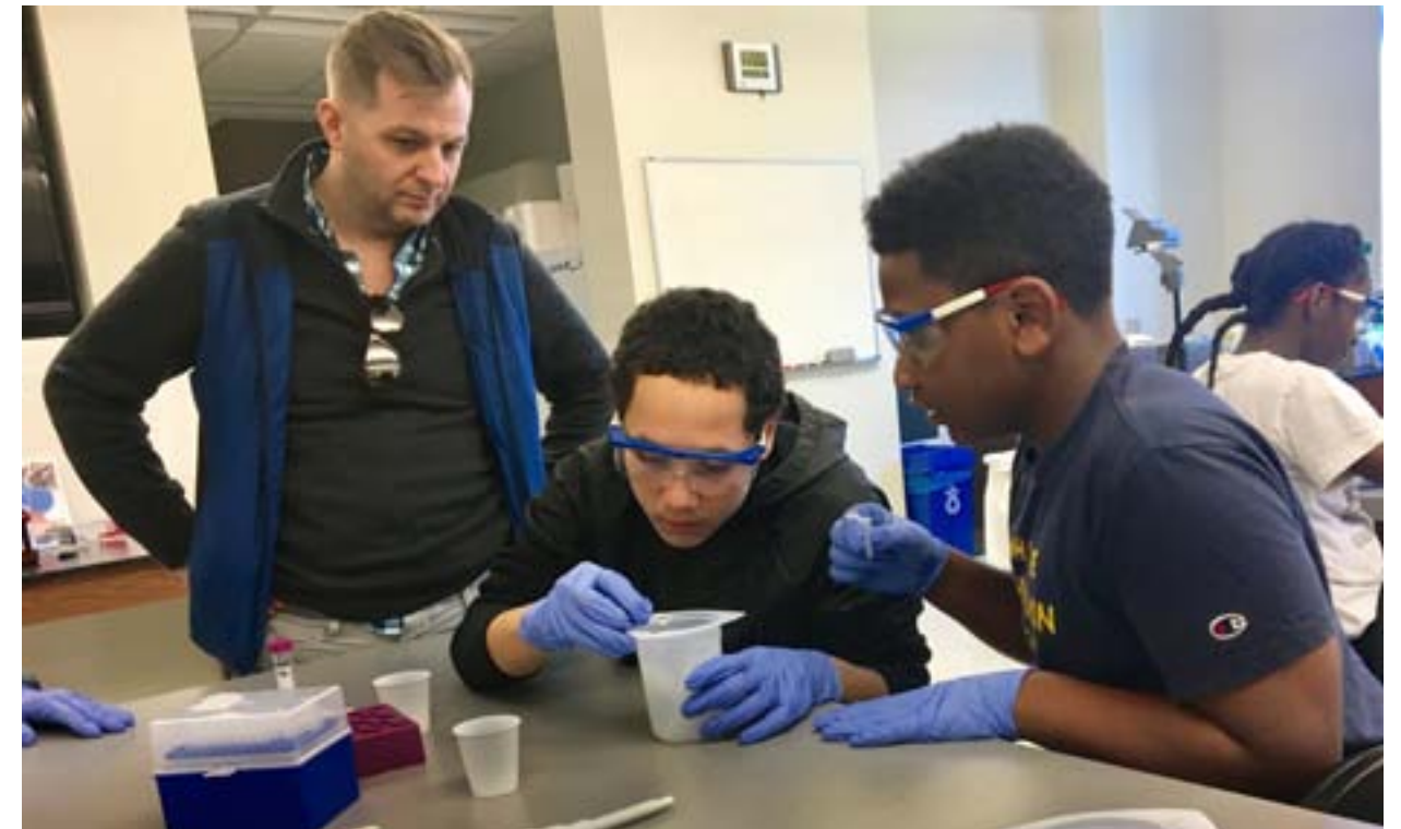
Above: Horizons for Youth students conduct DNA experiments in a science lab at the University of Notre Dame.

Combined, these services enable students to persist to and through college.