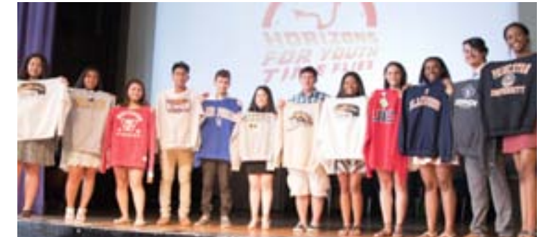
Above: After years of dedication and hard work deciphering best-fit schools, completing applications, and securing financial aid resources, our graduating high school seniors proudly display their post-secondary plans.

We have formally extended our program to support students throughout college, helping students navigate well-documented road-blocks to graduating in four years. We offer key interventions, such as coaching in course selection and major mapping, assistance with money management and budgeting, socio-emotional support and crisis management, financial aid renewal assistance, and providing resources for internships and job searches. We also work with students for whom college is not the best fit to discern fulfilling alternative post-secondary paths.