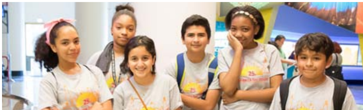
Above: Students in our Summer Academic Program take a Friday field trip to the Museum of Science and Industry.

As of publication, we have secured a total of $3,504,663 in pledged gifts from over 450 individual donors—over halfway to our goal of $5 million! Read on to learn more about how the campaign is positively impacting the lives of Chicago children.