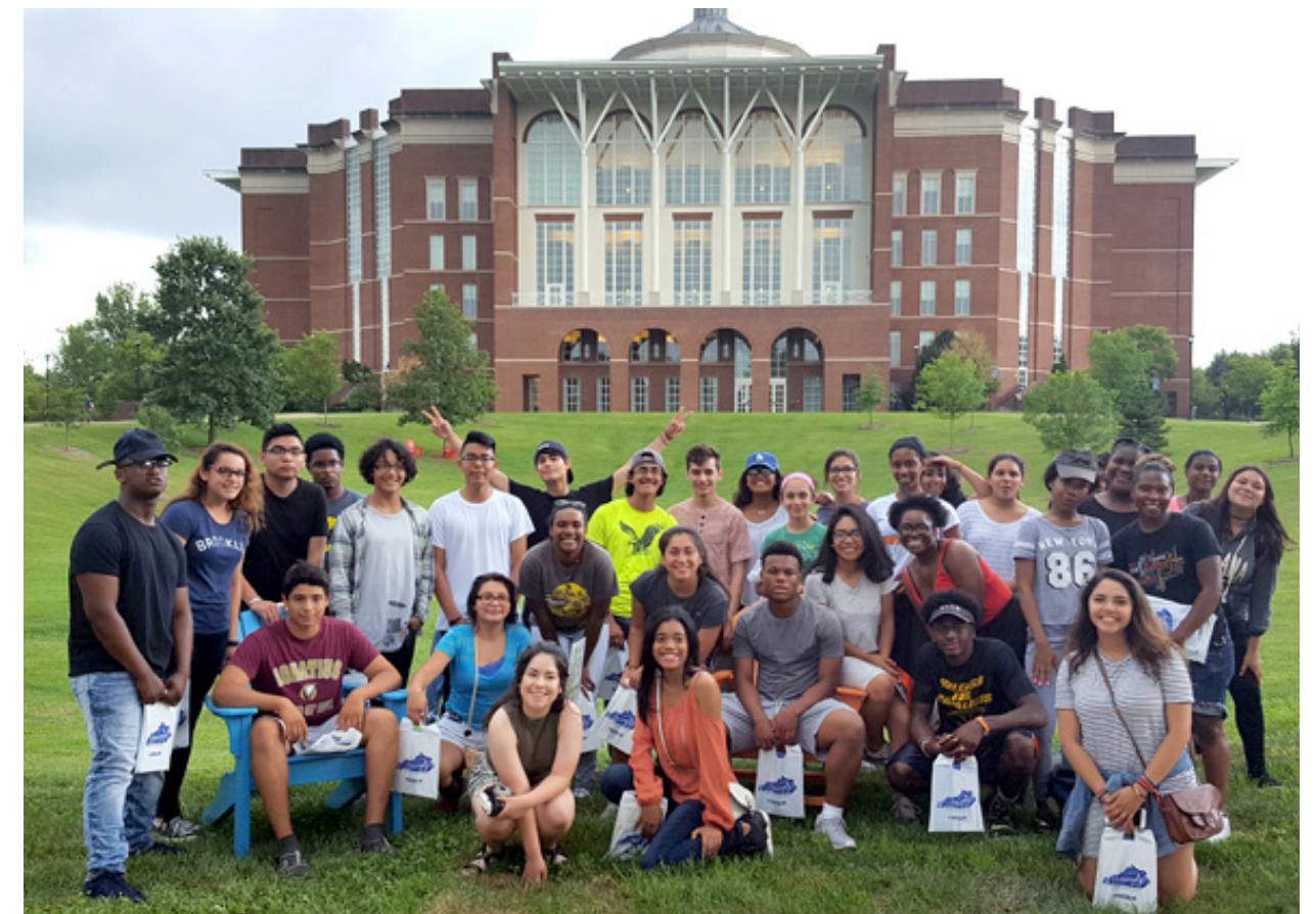
Above: Horizons for Youth high school students visited the University of Kentucky during a 2016 college trip. Every year, we focus on a different region of the country so that by the time our students reach their senior year, they have had the opportunity to visit a variety of colleges and universities.

Turn the page to see the many individuals who are helping us change the narrative of the lives of hundreds of Chicago children and their families.